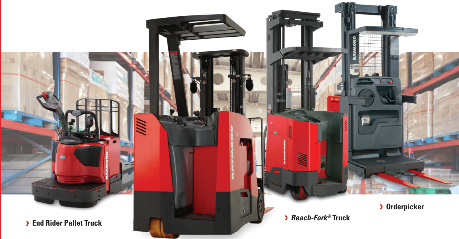
› End Rider Pallet Truck