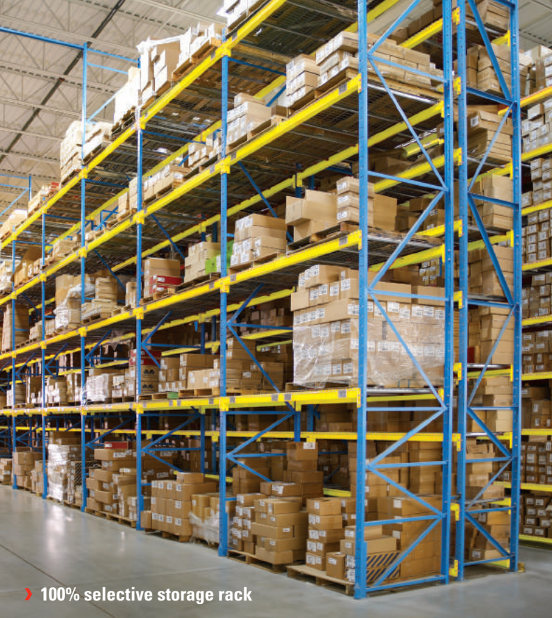
› 100% selective storage rack