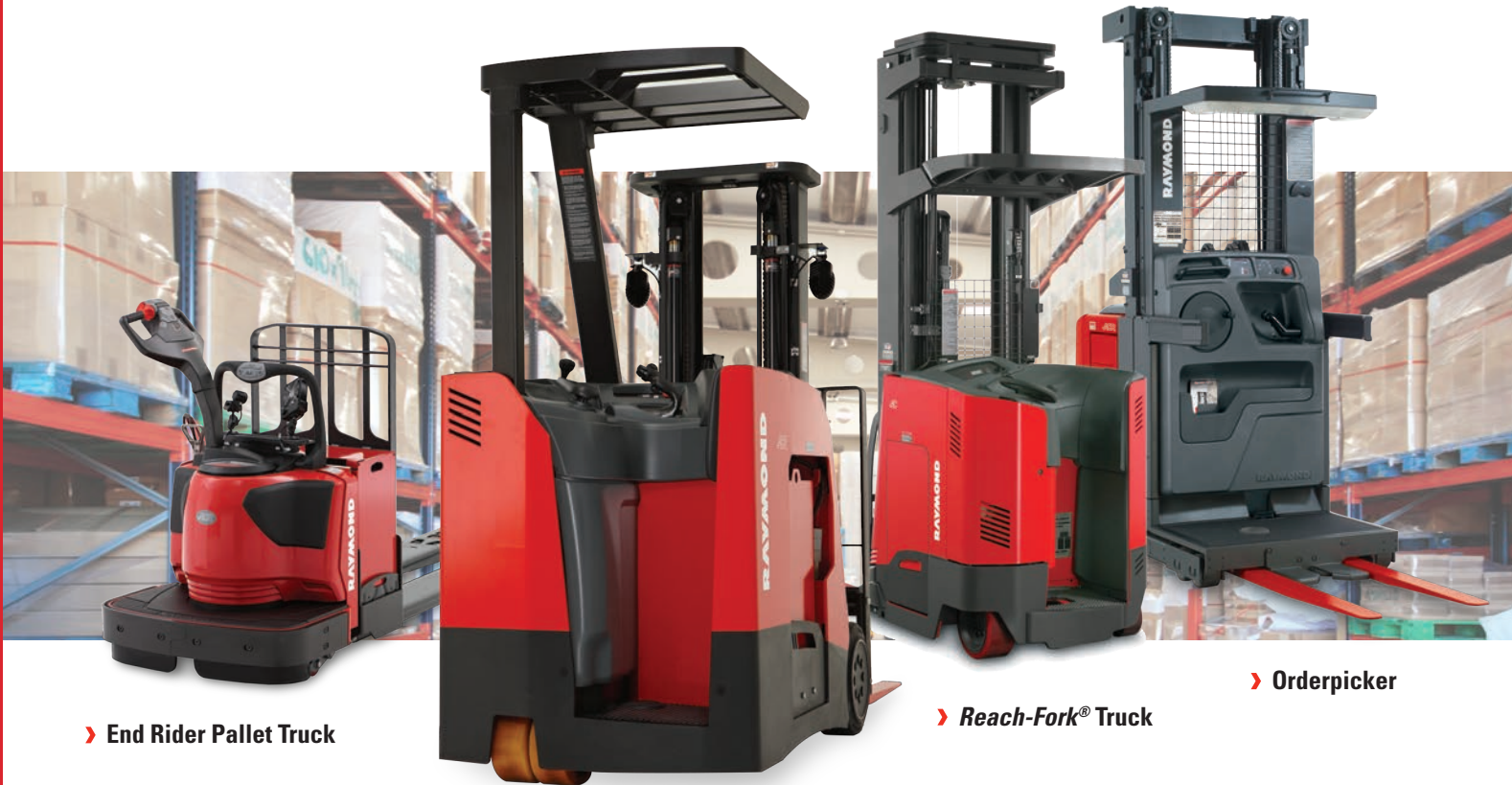
› End Rider Pallet Truck